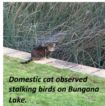
Domestic cat observed stalking birds on Bungana Lake.

By way of summary to date, progress remains slow but steady. We believe the work undertaken so far, along with that which is in the pipeline, reflects a systematic and evidence-based approach to the remediation of the lakes. We trust this will in time bear the results we are striving for.