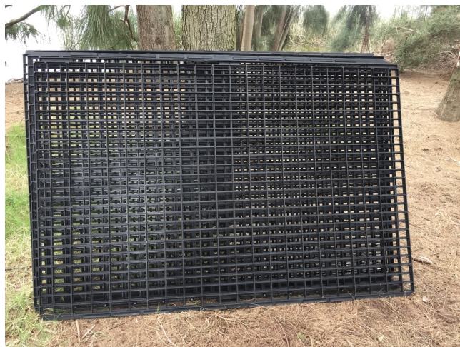
Replacement plants and mesh (plastic) for floating wetlands on Bungana Lake.