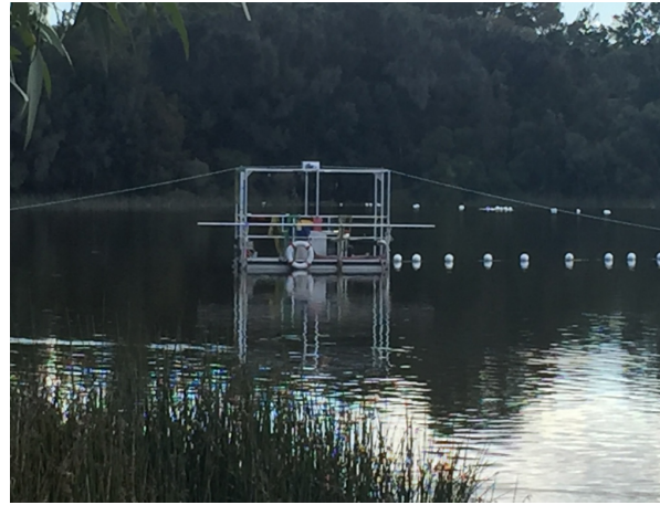
Barge on Bungana Lake.

The nutrient rich sediment being dredged from the lake is being stored temporarily on the Maylands Golf course. Once dried, it will be utilised elsewhere, essentially as fertiliser.